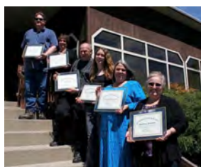
Volunteer Award Winners Enlarge

Sonora, CA -- The work of volunteers doesn't go unnoticed.